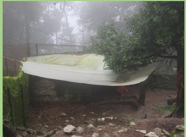
Fig: Pre-monsoon enrichments at herbivore enclosures