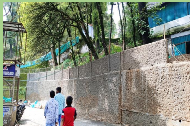
Fig: Construction of RCC parapet