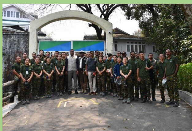
Fig: Education visit of Karnataka Forest Academy on 17.04.2023