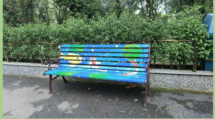
Fig: Artistic painting of chairs