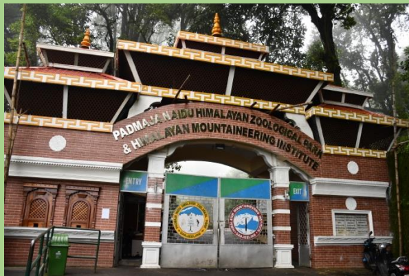
Fig: Reconstruction of new zoo gate