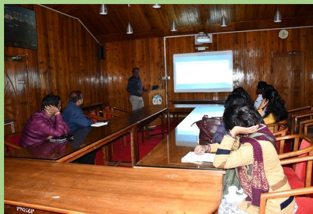
Fig: Education visit of staffs of Alipore Zoo on 27.04.2023