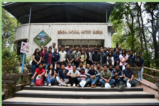
Fig: Education visit of Indian Forest service officers on 13.05.2023