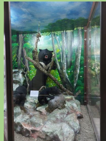
Fig: Displayed specimen (Wild Buffalo & Asiatic Black Bear) Background wall painting at Bengal Natural History Museum